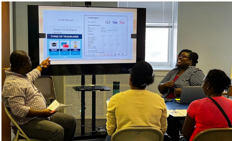
CLASS WITH VERIDIAN CREDIT UNION