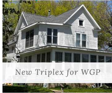
New Triplex for WGP