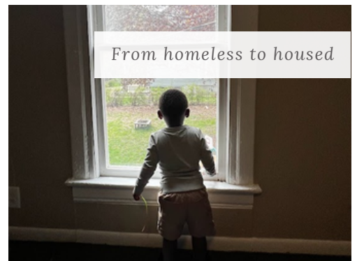
From homeless to housed